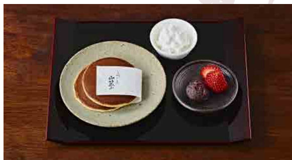
5. Dorayaki ¥605 铜锣烧

Soft, fluffy dorayaki filled with fresh cream and strawberries.