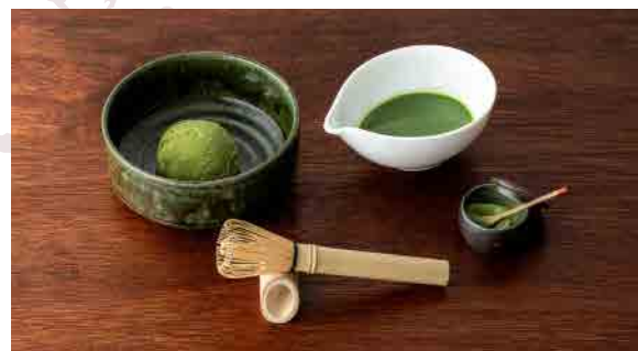
6. Green Tea Affogato ¥605 日式抹茶阿芙佳朵 (香濃濃縮抹茶冰淇淋)

Soft, fluffy dorayaki filled with fresh cream and strawberries.