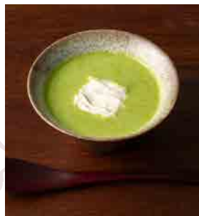
1. Green Pea Potage Soup with Yuba ¥495 玉叶青豆锅汤

▼ Please choose appetizer and dessert. ▼ 請選擇一通開胃前菜及甜品 Single item orders are also available.