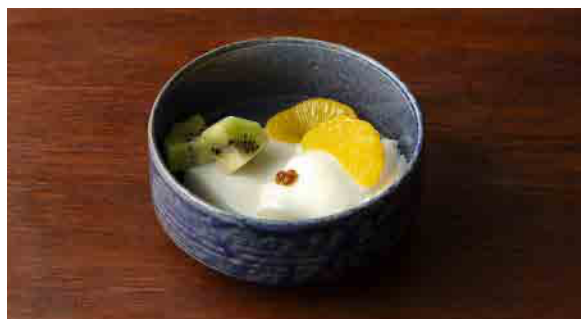
7. Almond Jelly ¥605 杏仁豆腐

Serve matcha ice cream with hot matcha sauce. If desired add 2 spoons of matcha powder to the matcha sauce and stir to taste. The bitterness of the matcha combined with the sweetness of the ice cream makes an exquisite dish.