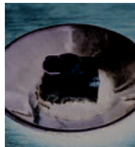
4. Crab Soybean Tofu ¥495 蟹肉豆腐