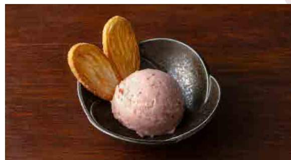
8. Seasonal Ice Cream ¥550 季節冰淇淋