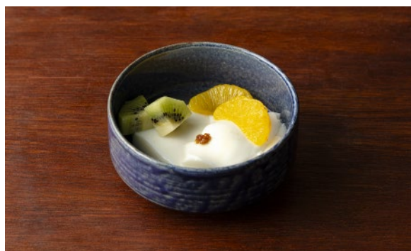
8. Almond Jelly

Serve matcha ice cream with hot matcha sauce. If desired, add 2 spoons of matcha powder to the matcha sauce and stir to taste. The bitterness of the matcha combined with the sweetness of the ice cream makes an exquisite dish.