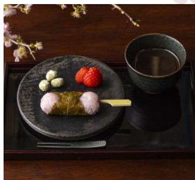
5. Sakura mochi ¥605 (cherry blossom rice cake)