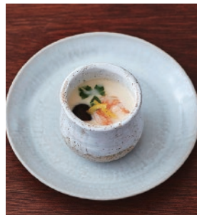
3. Steamed Egg Custard ¥495