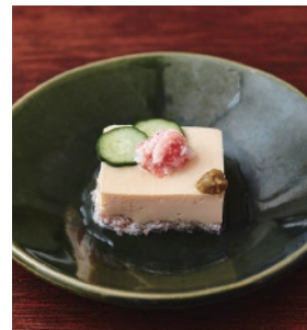
4. Crab Soybean Tofu ¥495