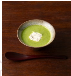
1. Green Peas Potage Soup with Yuba

▼ Please choose appetizer and dessert. Single item orders are also available. ▼ 請選擇一通開胃前菜及甜品