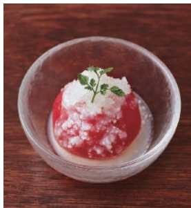
2. Tomato Salad ¥495

Enjoy the bright color and rich flavor of seasonal green peas. You can choose either hot or cold soup.