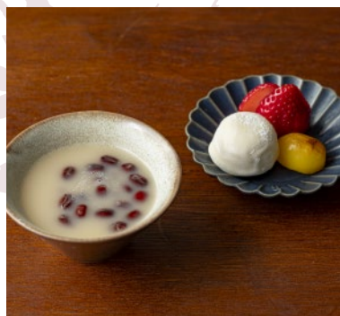
6. Yukimi Zenzai ¥605

Sakura mochi is a springtime rice cake snack made by wrapping salted cherry leaves around a rice cake.