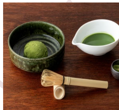
7. Green Tea Affogado ¥605

Warm zenzai with white bean paste made from Hokkaido. Serve with mochi ice cream.